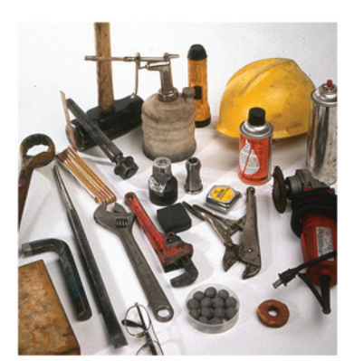
JAWS 2.0 can find and retrieve almost any dropped object!