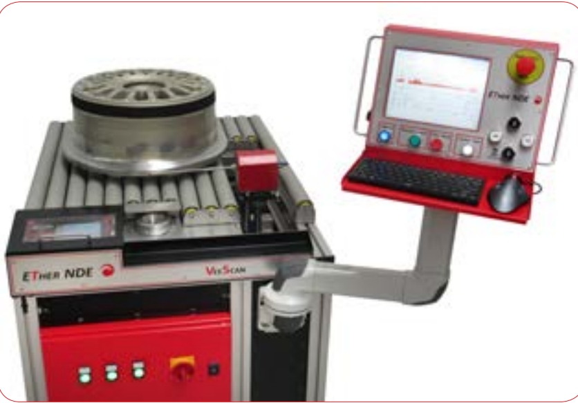
VeeScan Pivot Arm Option.

At ETHER NDE we understand that the key criteria for any Aircraft Wheel Inspection System is the need to guarantee detection of defects, the requirement to operate reliably twenty-four hours per day, 365 days per year. The demand for a simple and user-friendly interface and the business need to maximize speed of inspection and output is key. Balancing these objectives can be difficult, but we believe the VEESCAN measures up to the task.